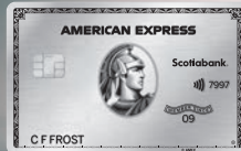
The Platinum Card®