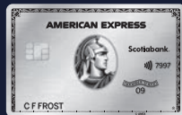
The Platinum Card®