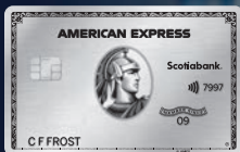
The Platinum Card®

This is our way of saying “thank you” every time you spend on your Card.